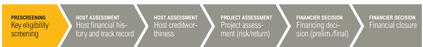
Figure 1 | Flowchart of steps in evaluating the “financeability” of EEPs

This Guide points out the key performance indicators and characteristics of Hosts and EEPs that Financiers typically evaluate when making financing decisions. The evaluation performed by Financiers is not limited to the EEP itself but in fact starts with an analysis of the Host — the legal entity owning or operating the facility where the EEP is implemented and related savings are generated. The Host is first evaluated because if it were to go out of business, there would be no cash to repay the Financiers, regardless of how